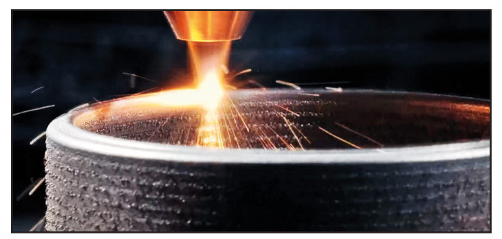
Metal additive manufacturing using a laser.